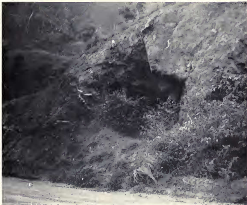
FIG. 83. Cave made by coal-mining, Mount d'Or, New Caledonia, nighttime resting site for Miniopterus a. australis and M. macrocneme .

Numbers found on New Caledonia were even smaller in comparison to the numbers found at Hog Harbour, Espiritu Santo, New Hebrides, where Baker and Bird estimated as many as 5,000 (mostly M. australis ) in one cave. The cave at Bouloupari never contained more than 400 or 500 bats. The largest number observed at Paita